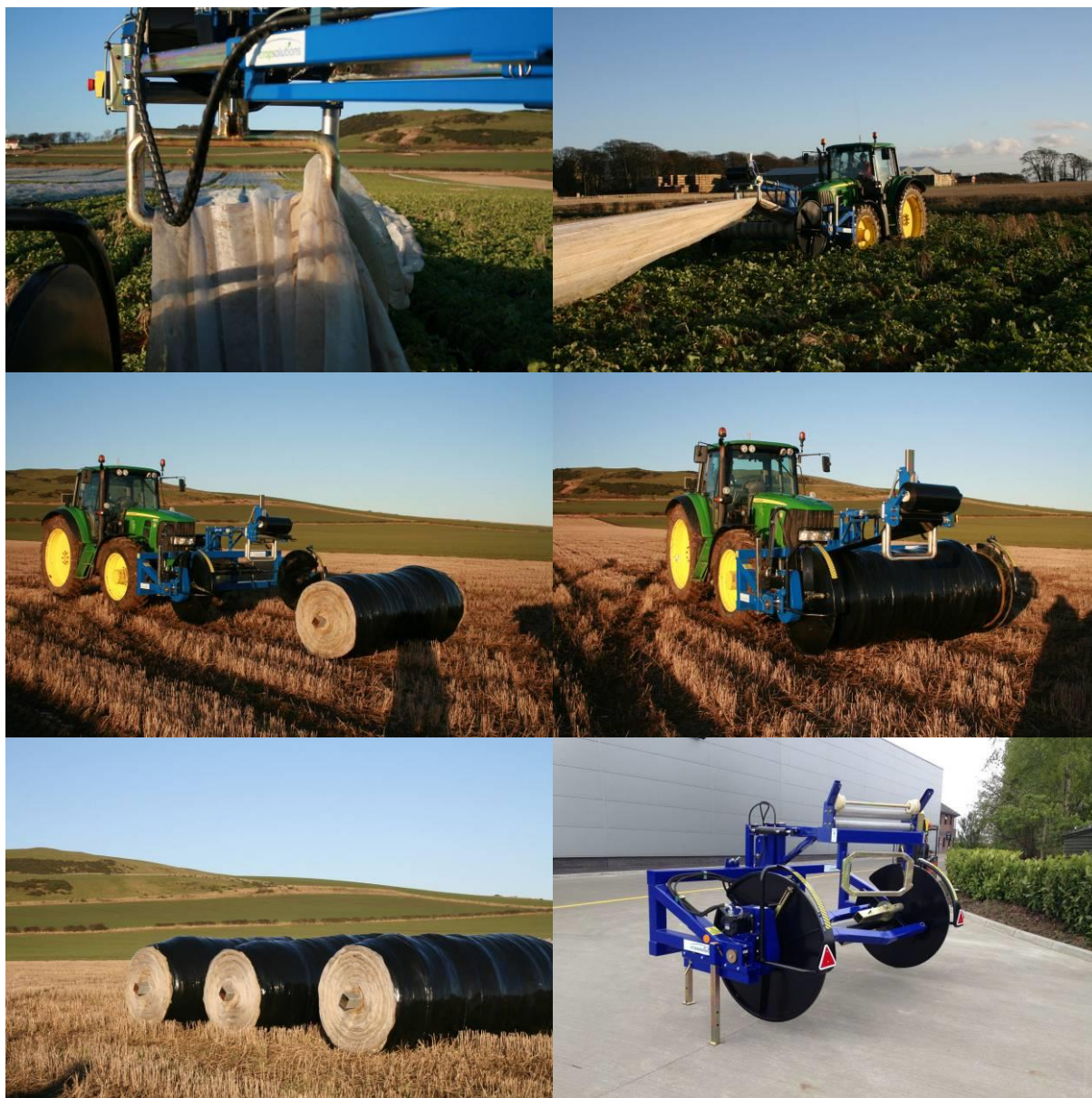
Figure 12. Mesh removal and bobbin system.

Mesh is removed by purpose designed, tractor mounted, bobbin systems (Figure 12).