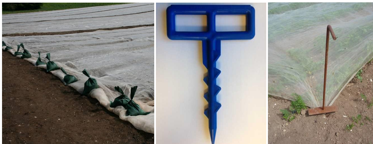
Figure 10. Sand/gravel bags for weighing down mesh, plastic peg and metal anchor stake.

Where there is a need to remove and replace mesh during crop growth, e.g., organic growers needing to weed, alternative securing methods can be used, such as sand/gravel bags and plastic or metal anchor stakes (Figure 10).