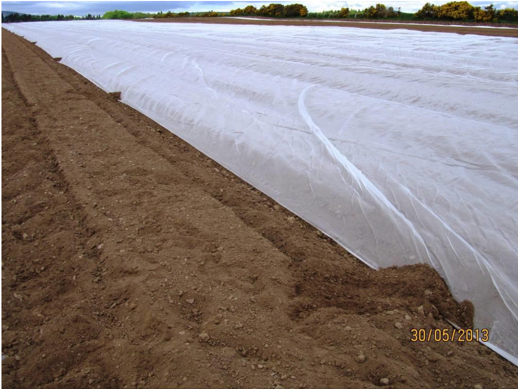
Figure 7. Mesh sheet held in place awaiting burial.

Field workers then temporarily secure the mesh in place by putting it in the furrow that has been machine dug to bury the mesh in and kicking a small amount of soil onto the mesh, ready for burial (Figure 7).