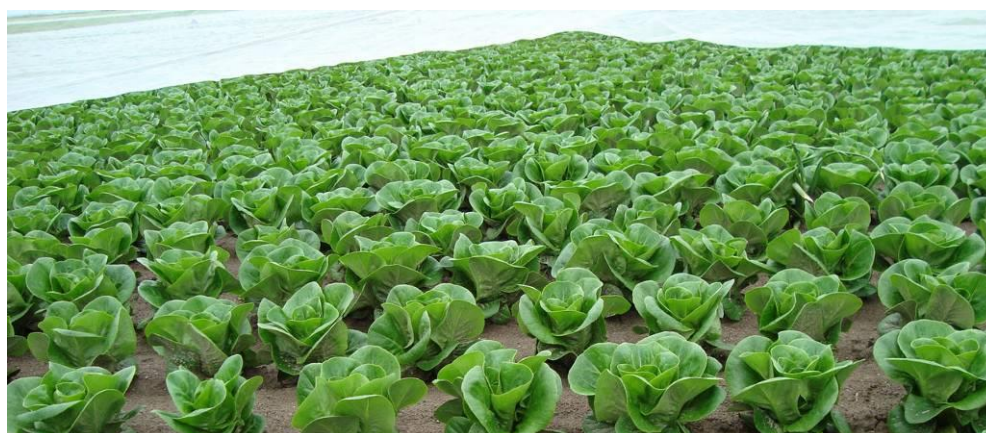
Figure 11. Lettuce growing under unsupported mesh.

With larger sheets it is possible for staff and even smaller tractors with special lifting bars to work under the sheets. In these cases the sides of the mesh is dug in, and the ends are held in place with pegs or sand/gravel bags. In most crops the mesh is self supporting (Figure 11).