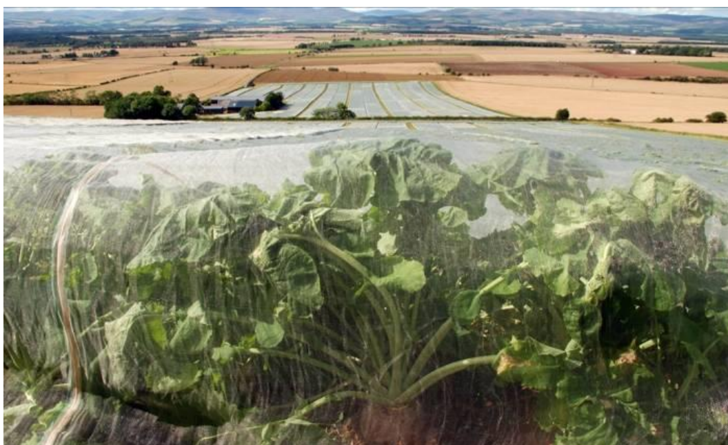
Figure 4. Field scale turnips growing under mesh.

Mesh covers have been in use in Israel and Europe for over 30 years, being first used in the UK in 1994 to keep root fly off cabbages in the UK. In this time manufactures and growers have refined and tweaked the technology, including all the machinery necessary to manage, lay and retrieve mesh. The industry estimates there is now some 100,000s ha in use (1,000s square km) across Europe, with individual farms having hundreds of hectares under mesh. Mesh is not therefore a bleeding edge technology with rough edges needing smoothing off. It is utterly farm proven over many years, so can be rolled out across hundreds of hectares, safe in the knowledge that tens of thousands of European and Israeli farmers & growers have already ironed out the wrinkles of using mesh.