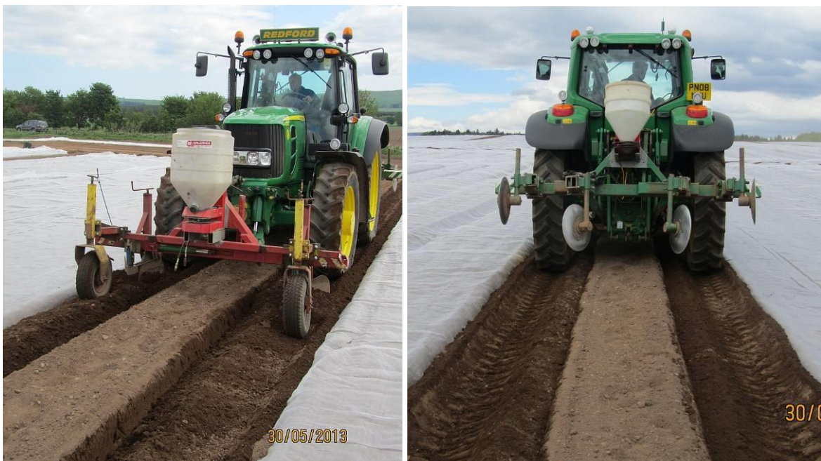
Figure 8. Mesh being buried in its furrow by tractor mounted tools and then compressed in place by the weight of the tractor.

The sheets are then secured in place by the tractor that created the furrow, pushing the soil back into the furrow and the driving over it to firmly secure the mesh in place (Figure 8). Once anchored like this, coupled with the higher weight and porosity of mesh compared to frost cloth mesh wont blow away.