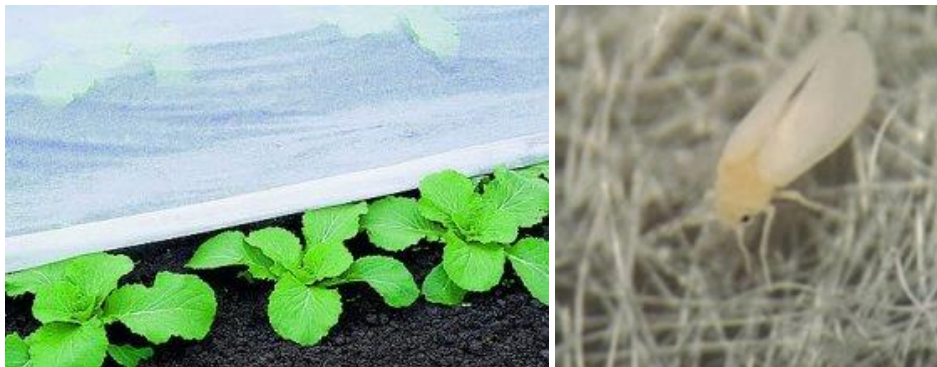
Figure 1. Spun bonded frost cloth.

Mesh crop covers 'evolved' from the spun bonded (non-woven) frost cloths, such as Agryl® (Figure 1).