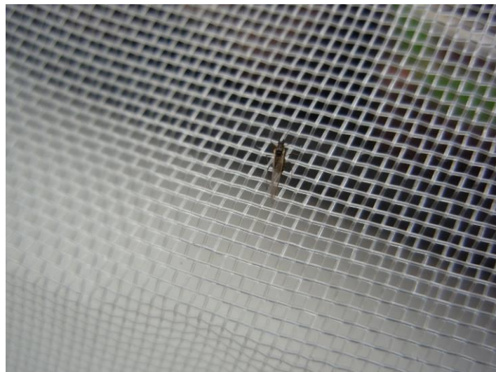
Figure 2. Mesh crop cover (0.6 mm holes) with winged aphid.