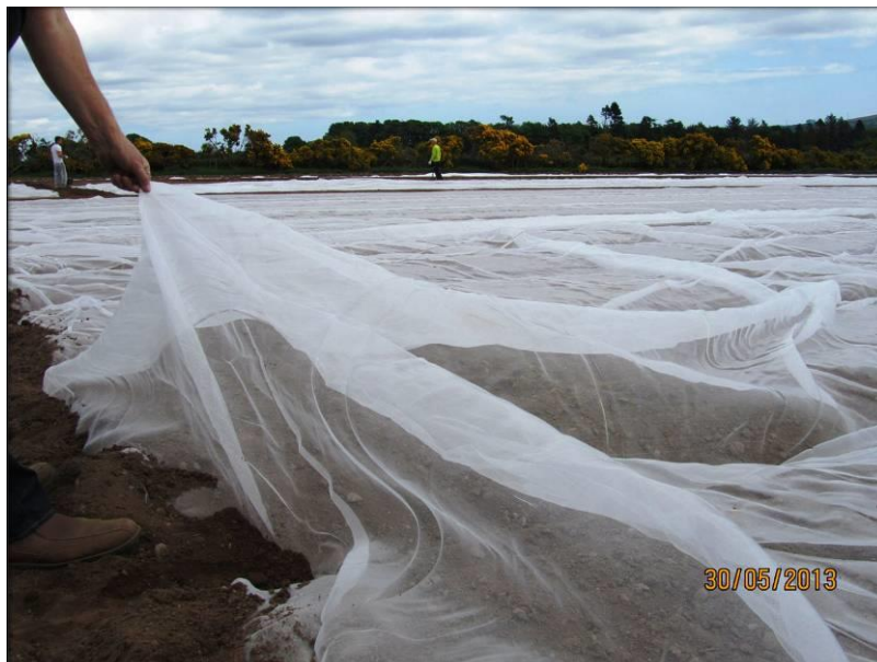
Figure 9. Leaving sufficient slack in the sheet for crop growth.

Where there is a need to remove and replace mesh during crop growth, e.g., organic growers needing to weed, alternative securing methods can be used, such as sand/gravel bags and plastic or metal anchor stakes (Figure 10).