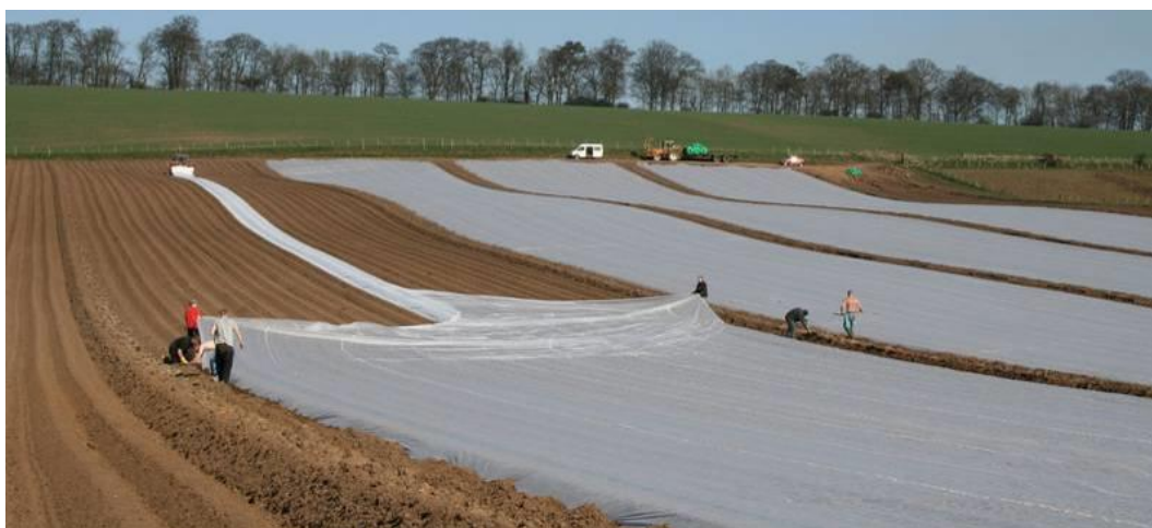
Figure 6. Mesh rolled out by tractor and then pulled across the field by hand.

The only manual part of the operation is for the unrolled mesh to be pulled across the blocks of land to be covered (Figure 6).