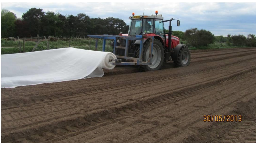
Figure 5. Mesh being unrolled.

For large scale field use, mesh management is almost entirely mechanised. Mesh is delivered as large rolls with the mesh folded down to the roll width (Figure 5). The roll is then rolled out down the field by tractor (Figure 5). Mesh is applied straight after planting, because as a barrier it needs to be in place before the pests move in.