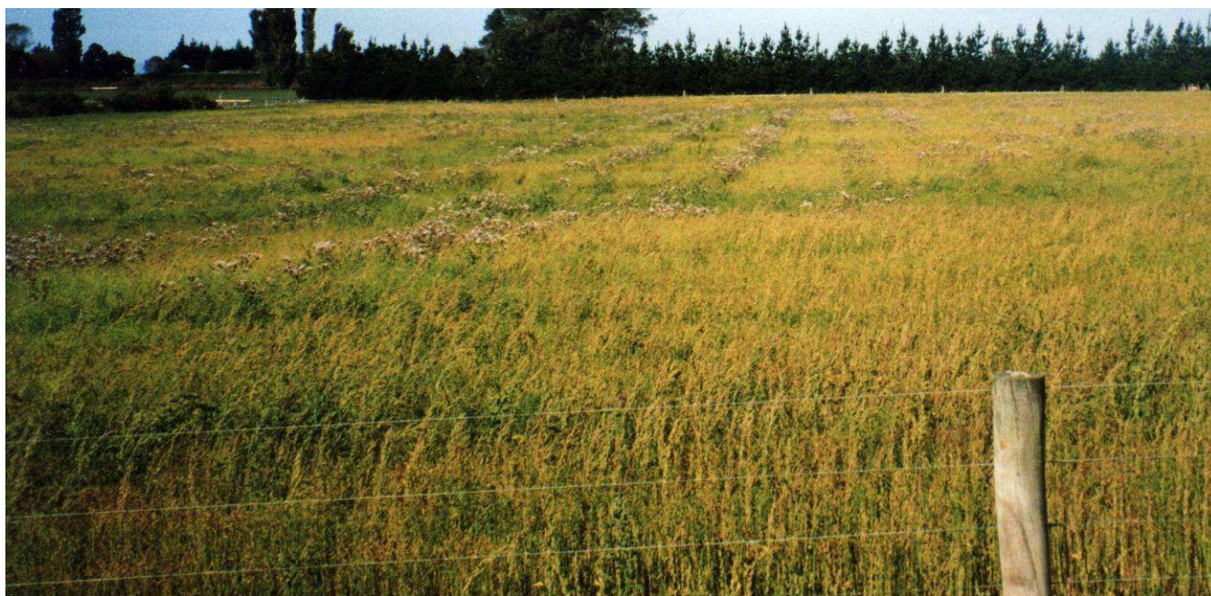
Figure 4. Narrow strips of Californian thistle (gone to seed) between wider thistle free strips following subsoiling with insufficient bout overlap in a linseed crop (with fathen).

Of all the non-chemical management tools for Californian thistle one stands head and shoulders above the rest in terms of potentially achieving an instant kill: subsoiling / deep ripping. This is one of those tools that is known of and being used by a small number of farmers, but one that has apparently completely bypassed the scientific establishment. Figure 4 Shows a field which was wall-to-wall with Californian thistle the previous year. In the autumn the field was subsoiled to kill the thistle, however, the driver did not match the bouts up correctly so there were strips of ground that were not subsoiled between the subsoiled bouts. This accidently made for a great experiment, in that the parts that were subsoiled were almost completely clear of Californian thistle, while the strips of field that were missed, show up as long thin strips of nearly solid thistle, which is now going to seed among the linseed crop.