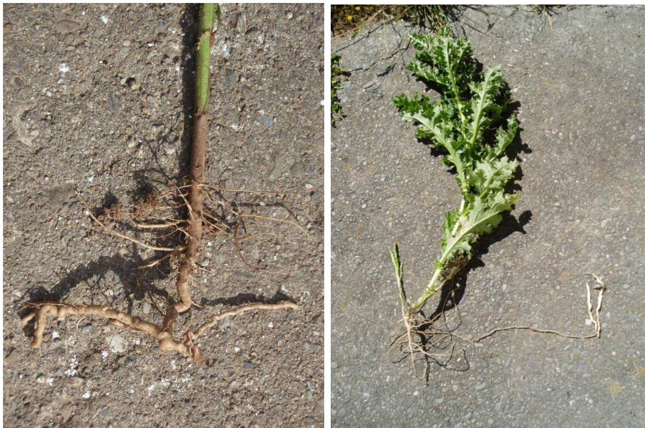
Figure 2. Left, Californian thistle spreading root and a vertical stem. Right, four month old plant originating from seed that has already produced the first horizontal spreading root along with a vertical shoot.

As shown in Figure 2, the Californian thistle stems arise from the spreading roots. A side root from the main tap root starts to grow upwards and then transforms from a true root to a true shoot, with the boundary between root and shoot delimited by the end of the small feeder roots emerging from the true root.