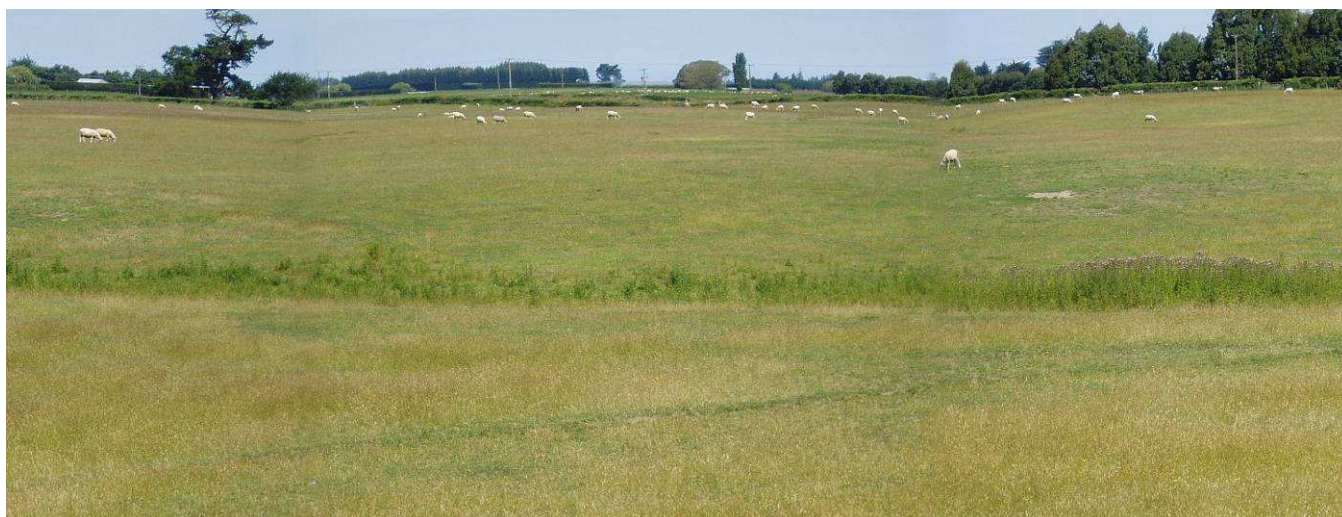
Figure 3. Californian thistle that has been growing in an old stream bed between Springston and Leeston on the Canterbury plains for two decades but that has not invaded the rest of the field over all that time.

A final point are the soil conditions that appear to favour Californian thistle. It is clear that Californian thistle favours some soil conditions over others, for example, the lack of Californian thistle across wide areas of farmland where the climate is amenable for the plants, while in similar climatic areas Californian thistle is the number one weed. Also within individual farms with a range of soil conditions, Californian thistle thrives in some areas but not others. Figure 3 shows a strip of Californian thistle that has been growing in an old stream bed, on the Canterbury plains, for over two decades, but that has never grown up and out of the stream bed into the rest of the field.