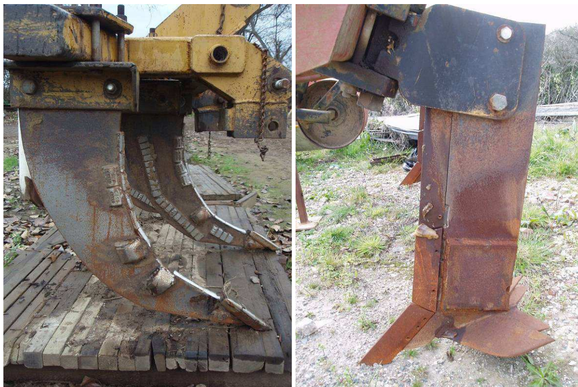
Figure 6. Standard chisel point subsoiler (left) winged subsoiler (right).

All of the above also requires that subsoiling / deep ripping is done correctly. Unfortunately, there are many cases where it is done badly with more harm than good being done. The key failure is subsoiling at incorrect soil moistures. Soils must be sufficiently dry, to the full depth of subsoiling, that they are no longer plastic, because if they are plastic they will deform not shatter. Equally, soils must not be so dry, that they no longer shatter into small crumbs, but break into large blocks. The only way to confirm if conditions are correct, and a good shatter to depth is achieved is by digging a soil pit after the subsoiler has passed. It cannot be over-emphasised the importance of doing the job right, and the key reference for this is Davies, Eagle and Finney's classic text "Soil Management" now rebranded for the 6 th edition as "Resource Management: Soil"[1].