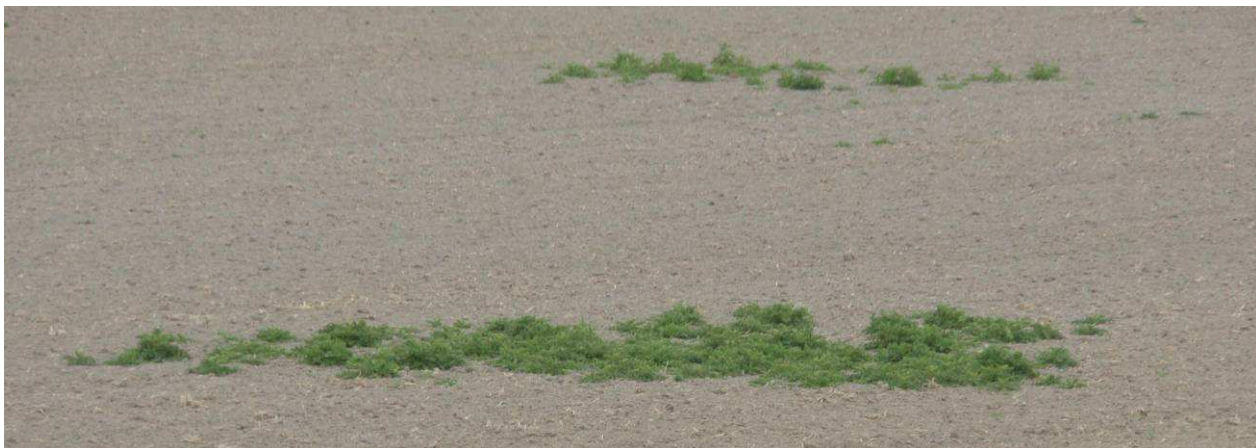
Figure 1. Californian thistle patches, each of which are individual cloned plants.

Californian thistle is unlike all the other thistles in New Zealand which are annuals or biennials, as it is a perennial that can live for decades and theoretically it is just about immortal as it is a creeping weed that spreads via its root system, so it is constantly regenerating. A patch of Californian thistle in a paddock is in fact one individual cloned plant, connected underground by the spreading roots that grow horizontally through the soil, and which also act as the food storage system that allows the plant to remain dormant through the winter. Figure 1 shows patches of Californian thistle in a recently cultivated field. Individual clones can achieve considerable size with diameters of 10 to 20 meters possible.