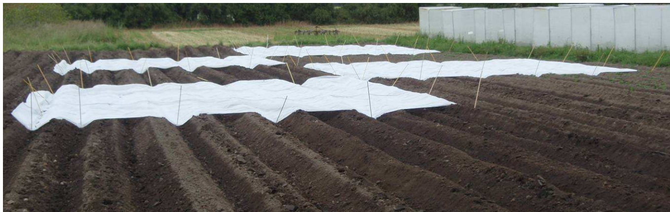
Figure 3. Start of field experiment.