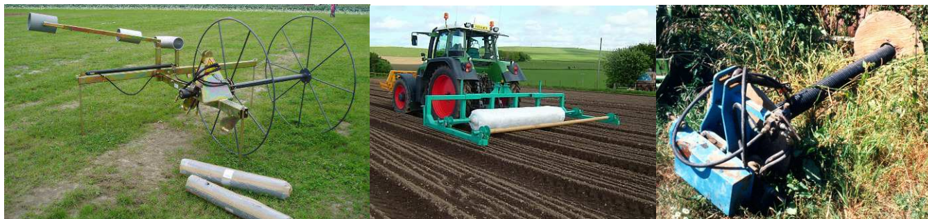
Figure 8. Three examples of floating crop cover handling systems all using removable bobbins.