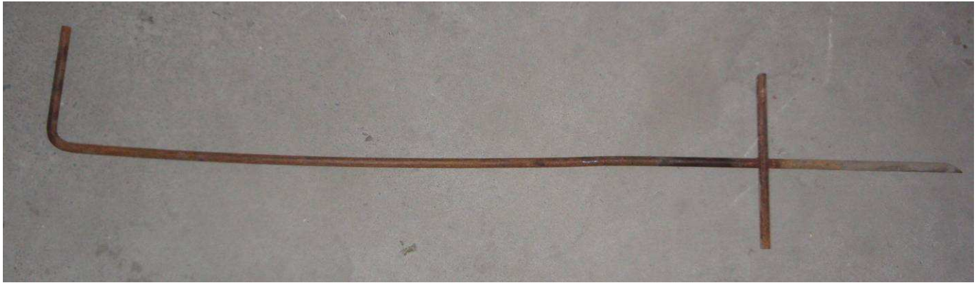
Figure 9. Custom steel stake for holding down floating crop covers.

Steel stakes are made from mild steel round bar 12 mm / ½" in diameter. 12 mm round bar typically comes in six meter lengths which will make four stakes. To make the stakes (read this list in conjunction with Figure 10 and Figure 9)