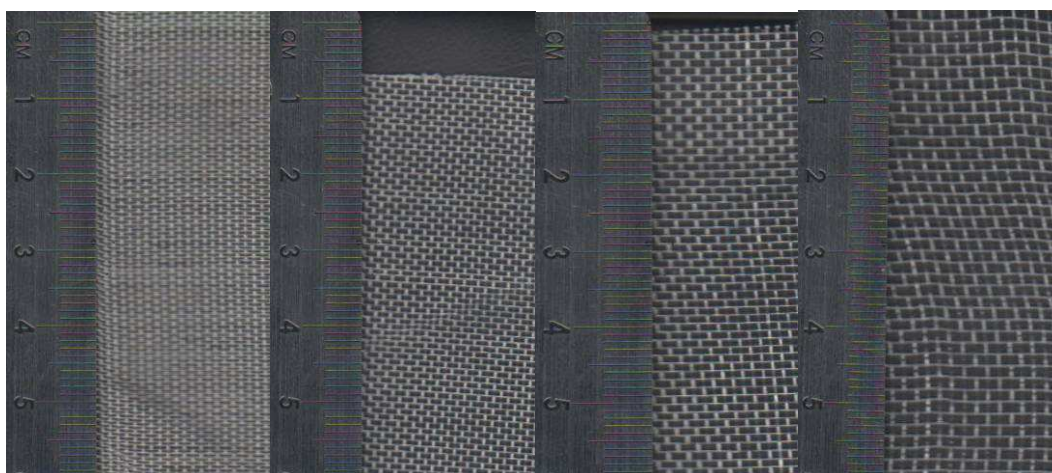
Figure 2. From left to right, four grades of mesh crop covers, 0.3 mm (thrips), 0.6 mm (aphids), 0.8 mm (flea beetle), and 1.3 mm (root fly) hole sizes.

Crop mesh is woven from monofilament materials such as nylon and polypropylene, i.e. it looks like cloth made of fishing line (Figure 2). It comes in a range of hole sizes from around 0.3 mm which is small enough to keep out thrips, to around 4.0 mm which is an effective butterfly, hail and vertebrate pest barrier (Figure 2).