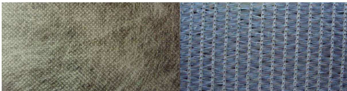
Figure 1. Spun-bonded frost cloth (left) and Mikroclima™ knitted frost cloth (right).

Mesh crop covers should not be confused with 'frost cloth' either spun-bonded (aka 'nappy liner') or knitted (e.g., Mikroclima™) (Figure 1). Frost cloth, as the name indicates, has been designed to protect crops from frost, by increasing the under-cloth temperature, often by several degrees. This means that frost cloth can also be used to extend the production season, both in spring and autumn, sometimes by several weeks. In contrast, crop mesh has been designed to have as little effect as possible on the temperature, relative humidity (RH), and other climatic factors under the cover. This means that crop mesh can be used in the middle of summer, when frost cloth would likely cause such high under-cover temperatures that the crop may be harmed, even killed.