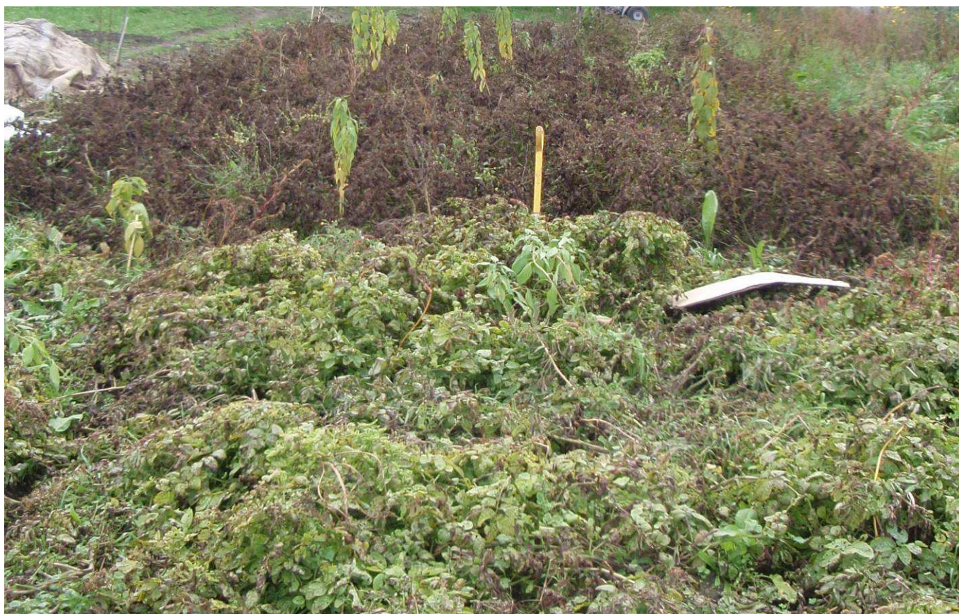
Figure 7. Photo of potato blight on not covered (background) and covered (foreground) plots at harvest on 8 May 2012