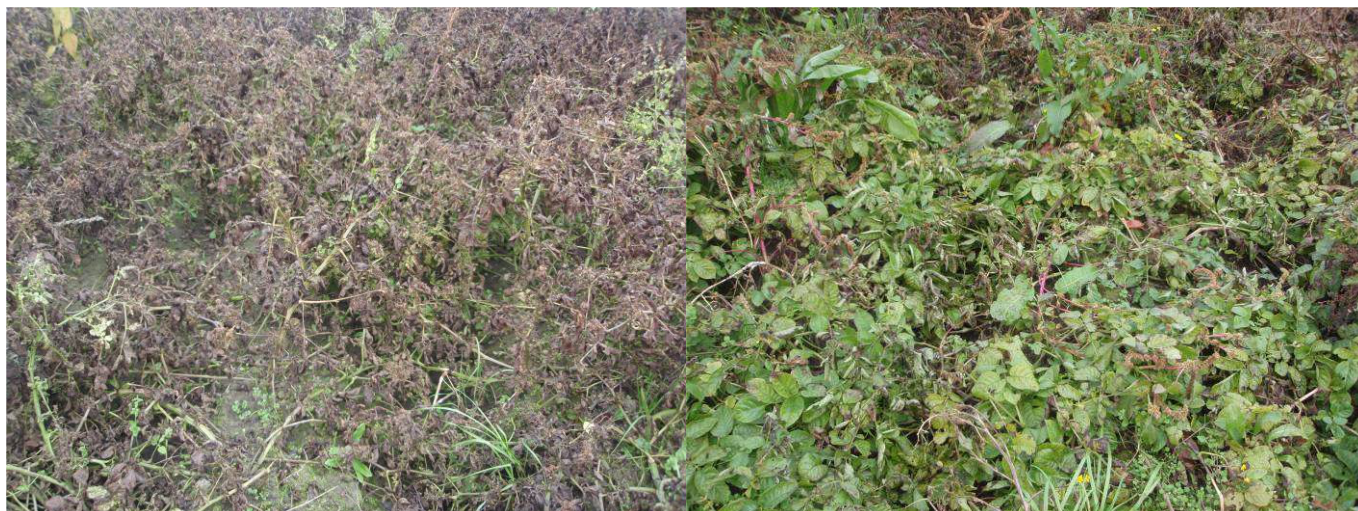
Figure 6. Photos of potato blight on not covered (left) and covered (right) plants at harvest on 8 May 2012

The difference in potato blight levels was very clear (Figure 6) with covered potatoes still remaining green at the end of the trial (8 May 2012) though with clear blight spots on the leaves, while the not-covered potatoes were brown with blight with all leaves shrivelled.