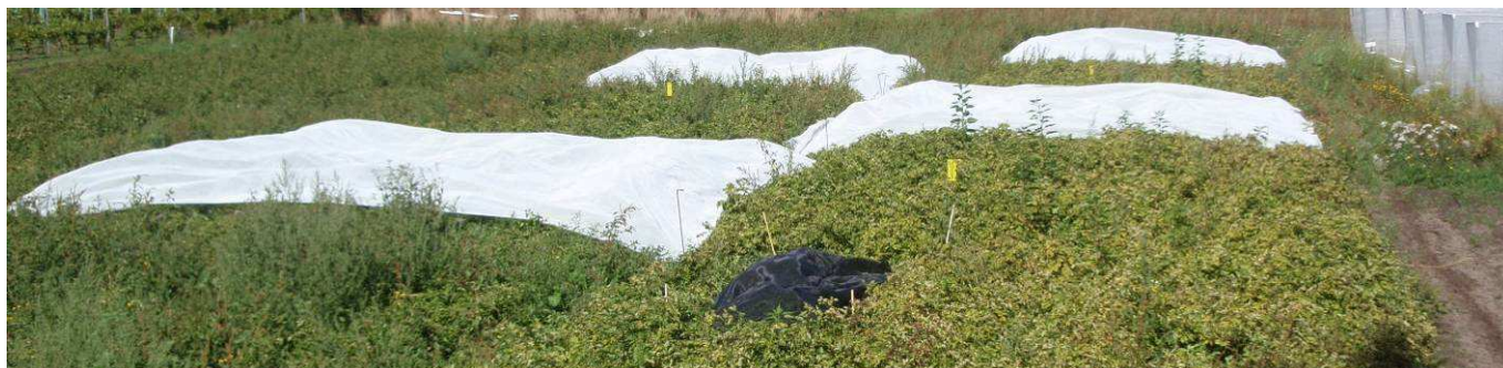
Figure 4. Experiment on 23 March 2012

Placing the mesh crop covers within a continuous field of potatoes proved to be a mistake, as the growing potatoes pushed the covers up thereby creating a 'green bridge' between the covered and not-covered plots, which allowed psyllids to move into the covered plots from the edges. This means that had the covered plots been physically separated from the not-covered plots (e.g., by a strip of grass, thus breaking the green bridge) the results may have been more in favour of the mesh crop covers.